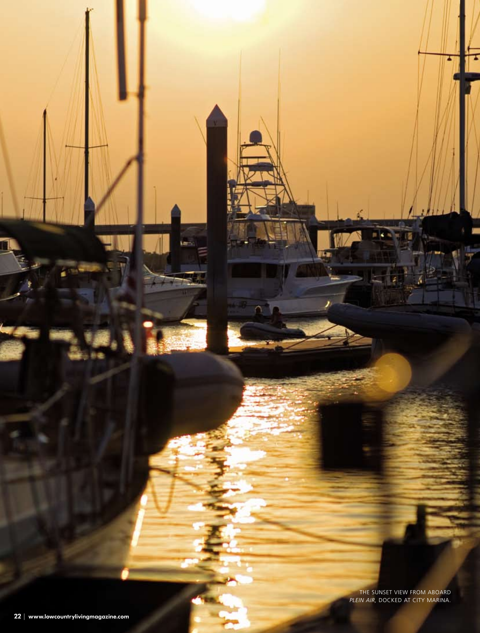
THE SUNSET VIEW FROM ABOARD PLEIN AIR, DOCKED AT CITY MARINA.